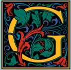
IAPHC Gallery Award honours superb printing